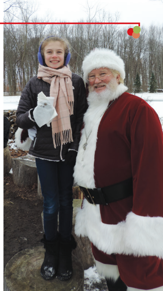
Include Santa Claus on a cold day.