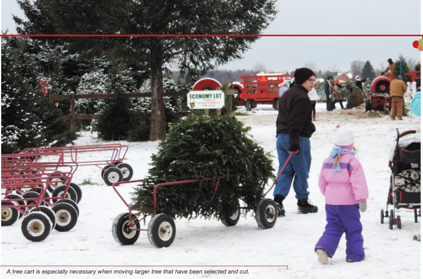
A tree cart is especially necessary when moving larger tree that have been selected and cut.