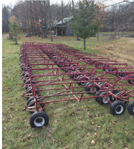
Tree carts or limos are very helpful (and popular!) for assisting customers in moving trees from the field to a processing area.

As a choose-and-cut operation you are representing the natural Christmas